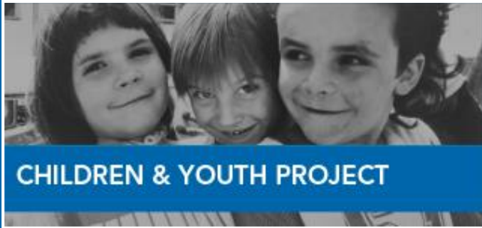
CHILDREN & YOUTH PROJECT