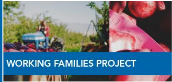
WORKING FAMILIES PROJECT