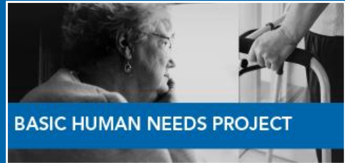
BASIC HUMAN NEEDS PROJECT